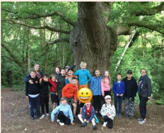
Oak class under a very LARGE Oak tree

I have missed seeing the children in school this week but had a lovely catch up with them in the sunshine over lunch today.